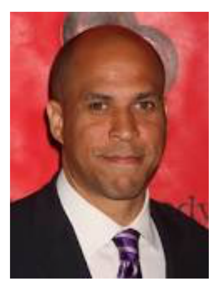
Cory Booker First African-American senator from New Jersey. Former mayor of Newark