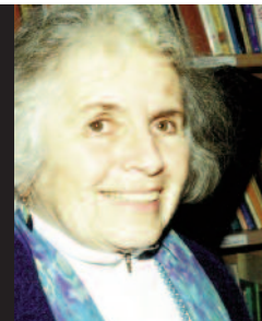
GRACE PALEY, 1922-2007